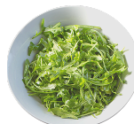
Rocket lettuce 2 cups (150g)