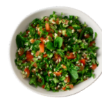
Parsley 2 cups (150g)