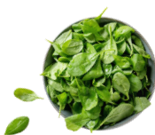
Baby spinach 2 cups (150g)